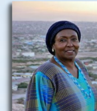
Dr Edna Adan Ismail

Chair Rotary Peace Centres Committee, Chair, Rotary Cadre of Technical Advisers 2018-19, Past RI Director, Past Rotary Foundation Trustee