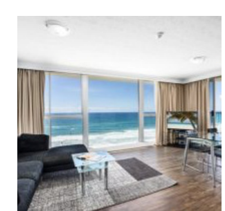
Golden Sands on Main Beach

Prices from $235 Distance from the Sheraton 12 min walk