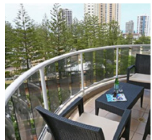
Oscar On Main Resort Prices from $195 Distance from the