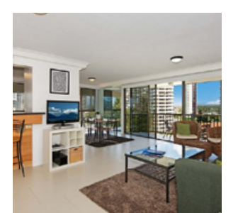
De Ville Apartments

Prices from $235 Distance from the Sheraton 12 min walk