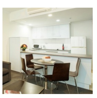
Sea World Resort

Prices from $250 Distance from the Sheraton 17 min walk