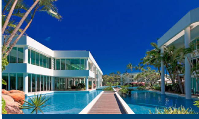
The Boadwalk - Sheraton Mirage Resort

Alternatively you can call them directly on: (07) 5577 0000